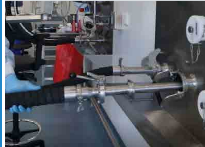
BocLock with handle on the TP side for suction rod (reverse BocLock)