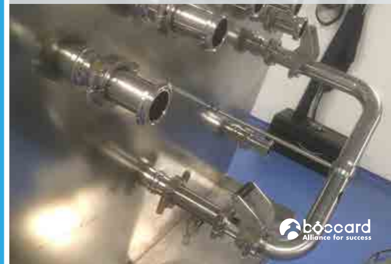
Transfer panel converted to BocLock version (use of clamp / BocLock adapters) to keep the original TP